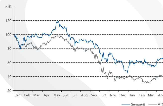
Semperit share price and ATX – comparative development January 2008-April 2009

B&C Privatstiftung, Vienna, is the stable core shareholder of the Semperit Group, with a stake of over 50%. The remaining shares are in free float.